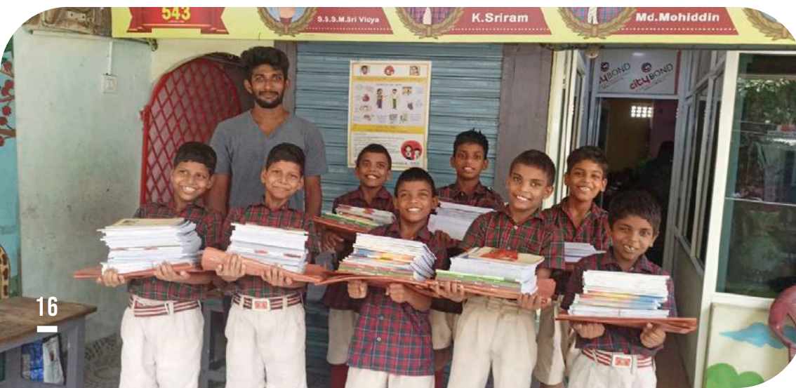
A few children from the Sankalpam home at the beginning of the 2023-2024 school year.